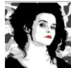
Helena Bonham Carter